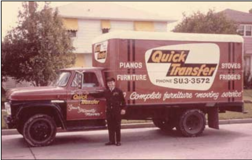
Your friendly mover (Herb in uniform). Votre ami déménageur (Herb en uniforme).