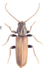
Longicorne brun de l'épinette