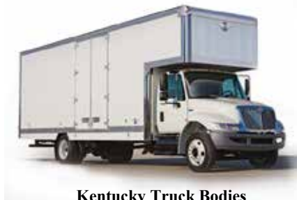
Kentucky Truck Bodies

The most versatile range of custom-built moving vans in the industry.