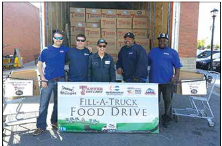
Tanner Van Lines – Food Drive