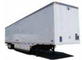
Custom Built Moving Vans