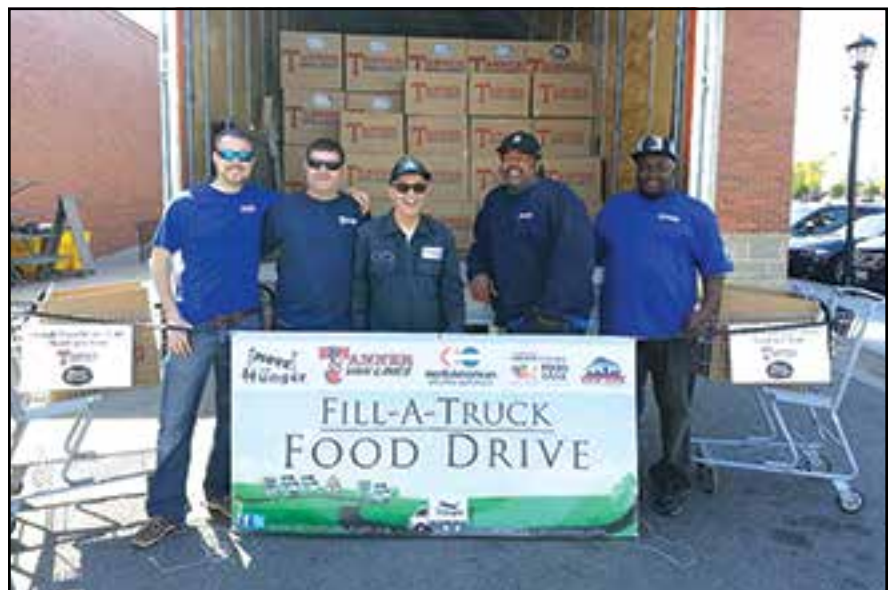
Tanner Van Lines – Food Drive