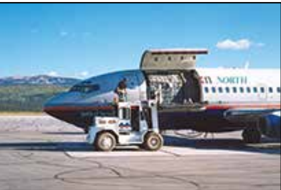
Opération de chargement, Norman Wells, NWT. • Cargo loading, Norman Wells, NWT.

afin de desservir sa population relativement mobile.