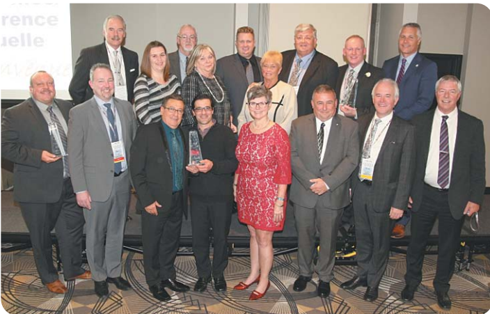
CAM 2017 award winners and presenters.

Each year, members of the Canadian Association of Movers get together to honour deserving members of the Canadian moving industry. The awards are: Distinguished Service, Industry Achievement, Innovators, Industry/Public Service, Agent of the Year and Independent Mover of the Year. Worthy awardees for 2018 will be honoured at CAM's most popular event.