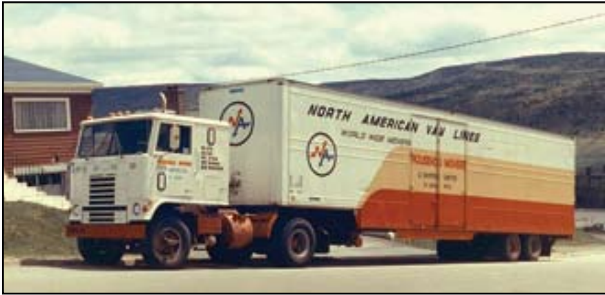
One of Household's original long distance units.