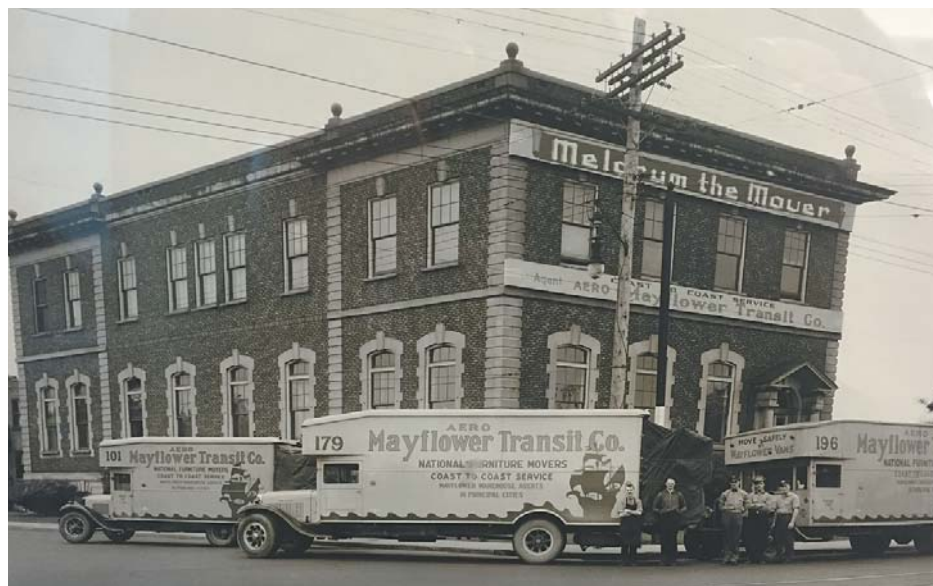
Meldrum head office circa 1936 • Siège social de Meldrum vers 1936

The history of Meldrum The Mover parallels that of Canada and Montreal. During the Second World War, Meldrum The Mover was called to duty to transport top-secret shipments for what was later known as the “Manhattan Project.” Many times during that period, three identical Meldrum tractor trailer units would be dispatched to the Chalk River Laboratories in the Ottawa Valley. All three units would back to a loading dock, but only one trailer would be loaded after the drivers had been escorted off site. The drivers would return and each be given a different destination, along with an RCMP escort. Meldrum The Mover knew it was involved in something important, but had no idea of its real