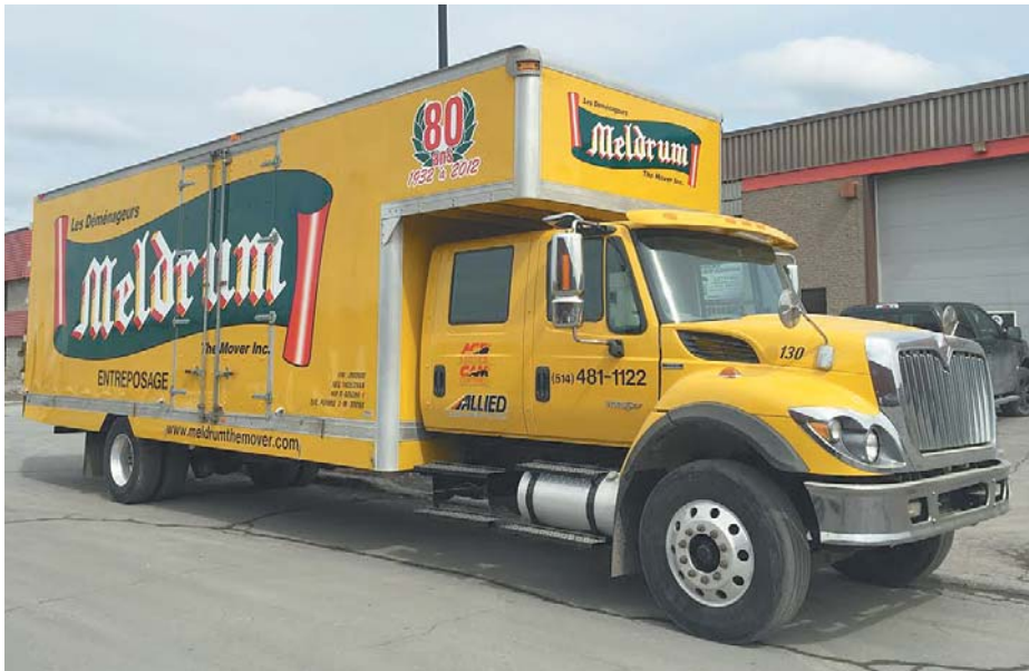
A part of Meldrum's up-to-date fleet (local unit) • Une partie de la flotte moderne de Meldrum (unité locale)

importance or, for that matter, the existence of an atomic bomb.