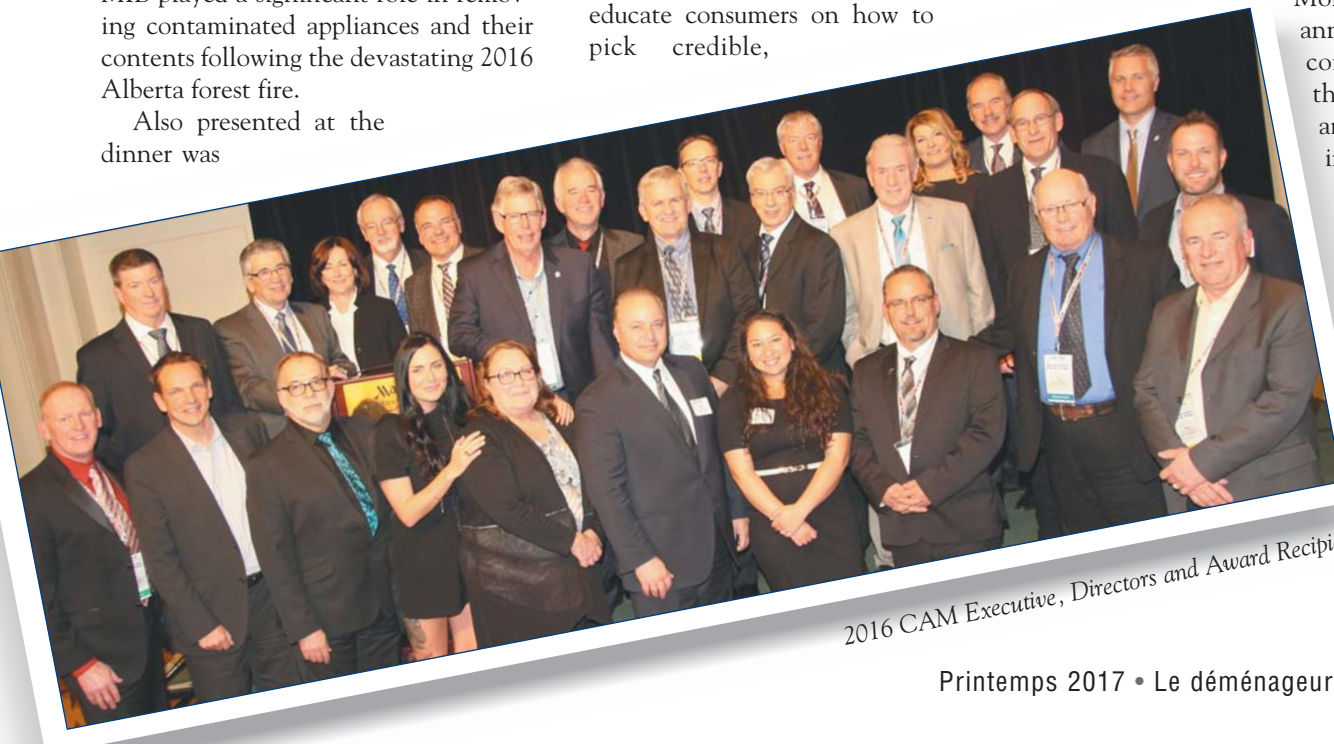
2016 CAM Executive, Directors and Award Recipients

Come on out to CAM's 2017 Annual Awards Dinner in Montreal and celebrate the 150 th anniversary of Confederation, Montreal's 375 th anniversary and the contributions of the very best among us in this industry.