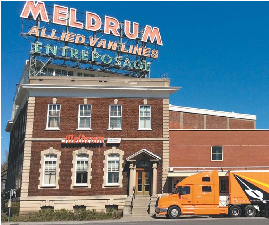
Siège social de Meldrum dans le centre-ouest de Montréal (NDG) • Meldrum head office in west-central Montreal (NDG)

Au cours des décennies suivantes, Les Déménageurs Meldrum ont bénéficié de leur position de choix dans le marché de Montréal en raison du fait que la ville était la capitale centre du Canada. Les affaires allaient en croissance tout comme la cité elle-même. L'Expo 1967 s'est avérée une autre période marquante, et Les Déménageurs Meldrum étaient mis à contribution pour déménager, assembler et organiser plusieurs des pavillons de l'Expo.