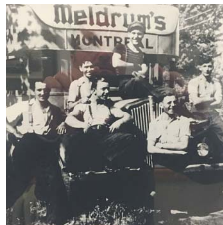
Le bon vieux temps avec nos bons vieux amis • The good old days with some of our good old boys