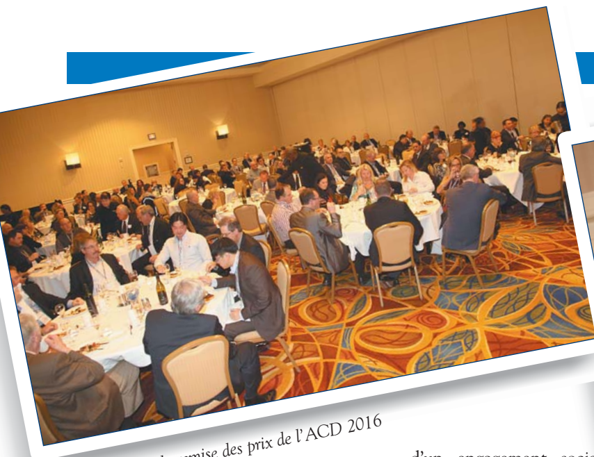
Dîner annuel de remise des prix de l'ACD 2016