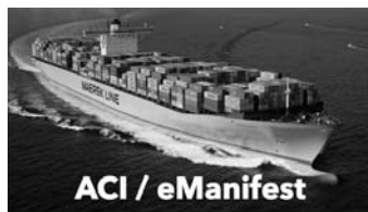
ACI / eManifest