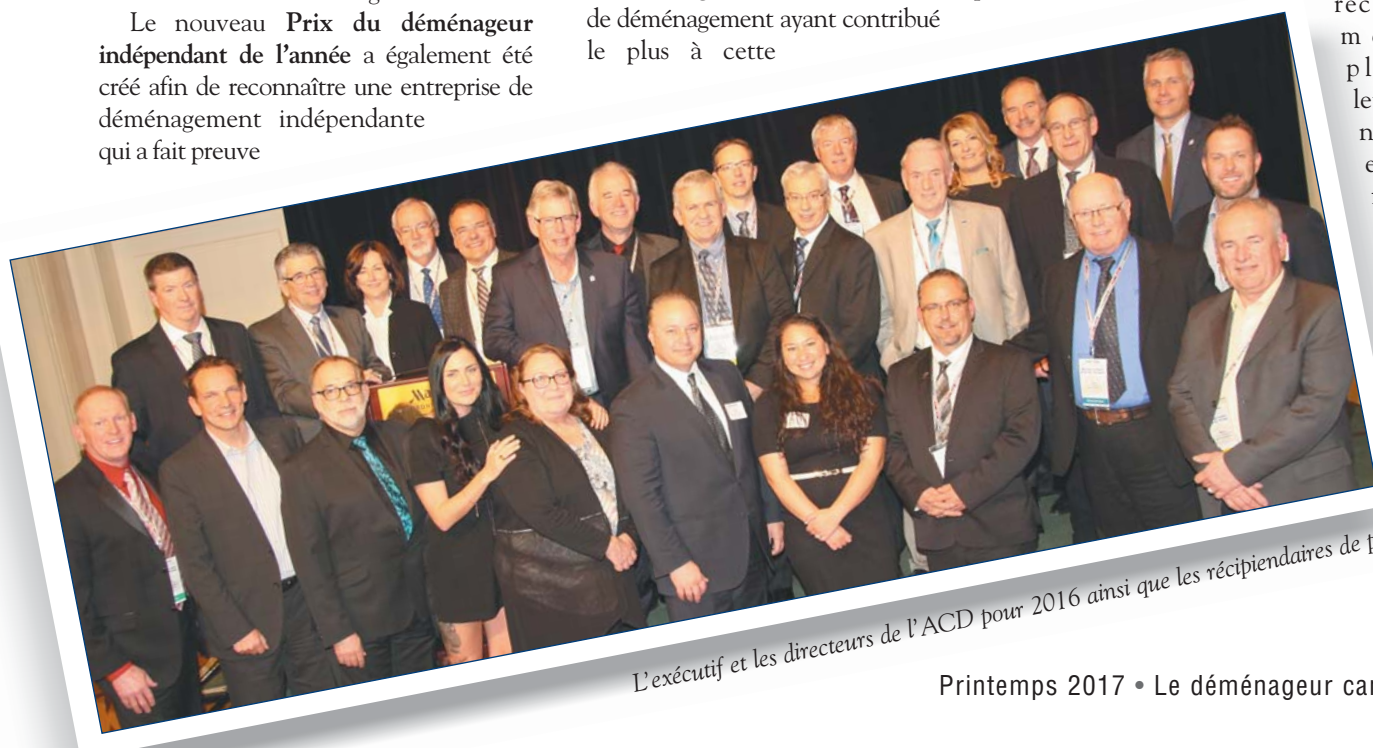
L'exécutif et les directeurs de l'ACD pour 2016 ainsi que les récipiendaires de prix