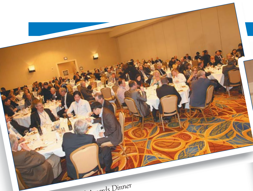
CAM 2016 Annual Awards Dinner